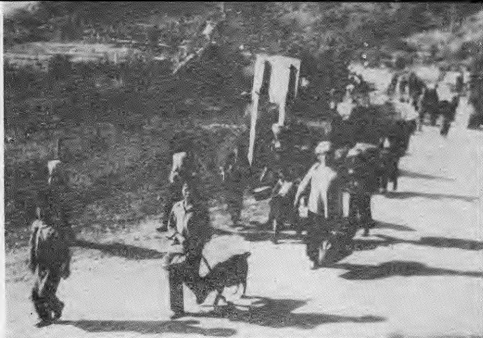
In Lang Son province.