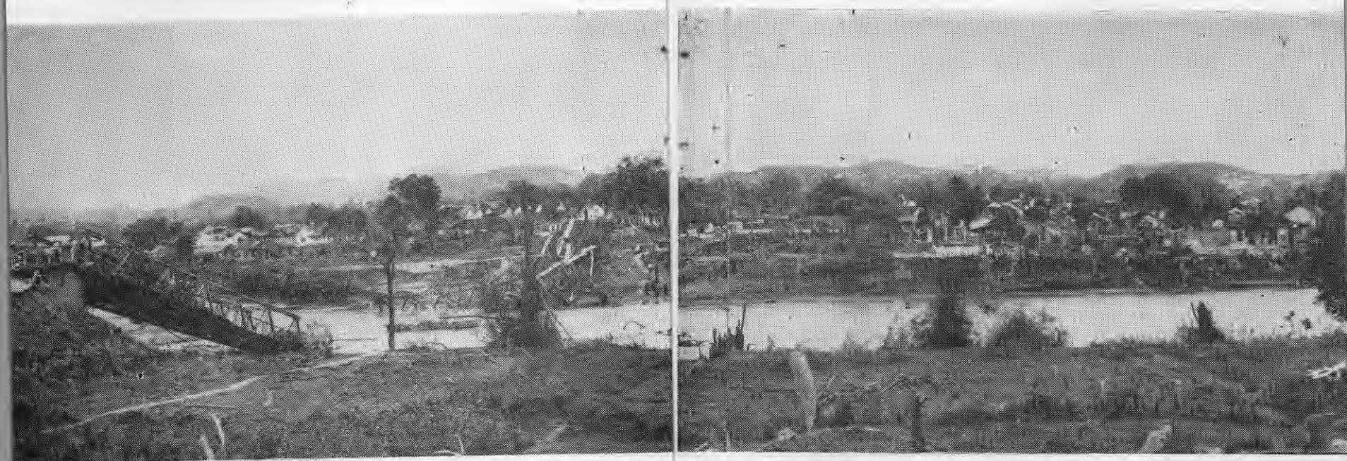
Part of Cao Bang town destroyed by the Chinese aggressors.