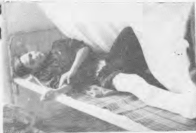
A victim of the Chinese bombardment of Lang Son town. He had a broken leg.