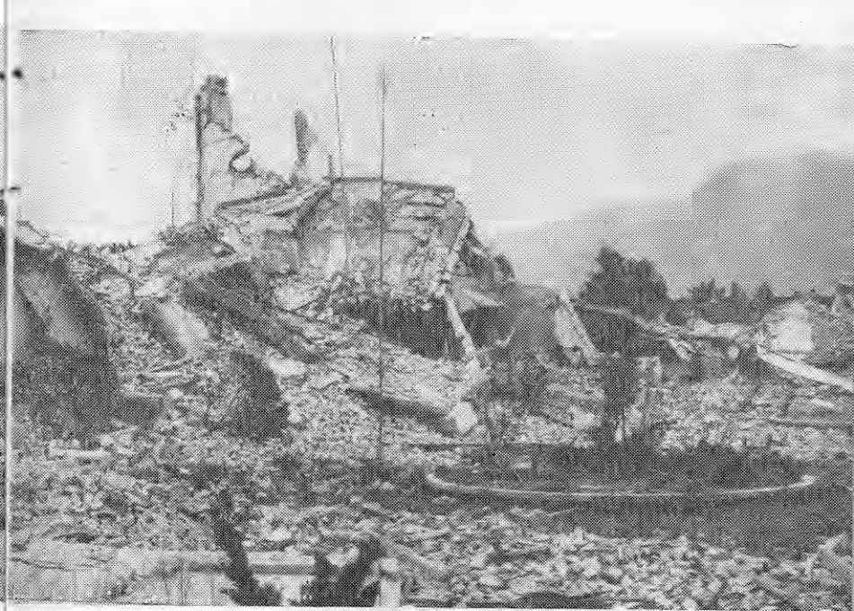
The office of the People's Committee of Cao Bang province destroyed by dynamite.