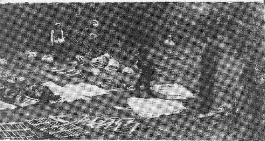
Vietnamese and foreign journalists examining the site of the Tong Chup massacre.